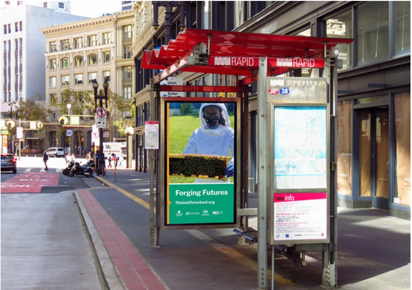
In honor of Lights On Afterschool, digital billboards across the nation will illuminate the critical work of afterschool programs to support kids and working families.